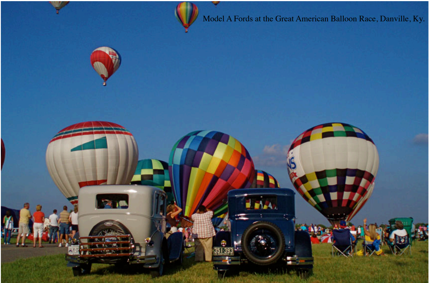
Model A Fords at the Great American Balloon Race, Danville, Ky.