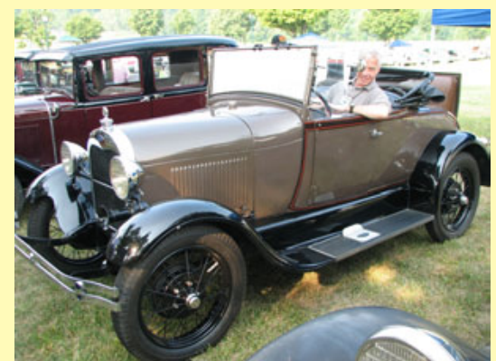
Scenes above from our summer tours