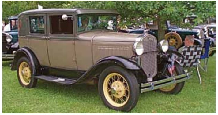
Carl keeps his current Model A "high and dry."